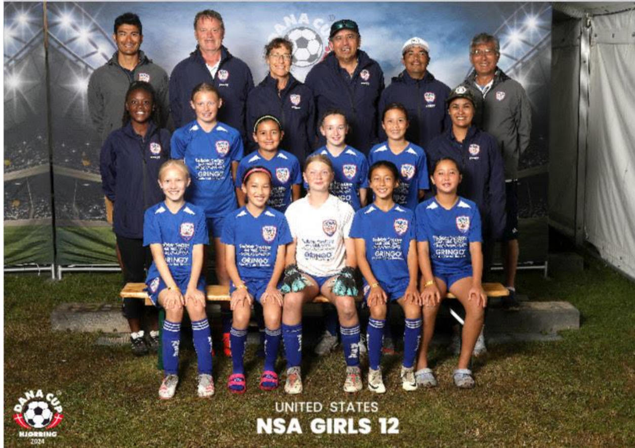
Cox Lily Oahu HI G12