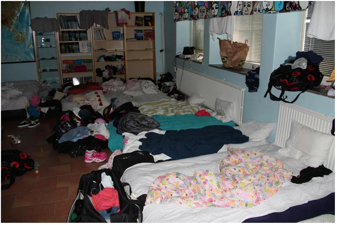
Okay to have aisle in the middle