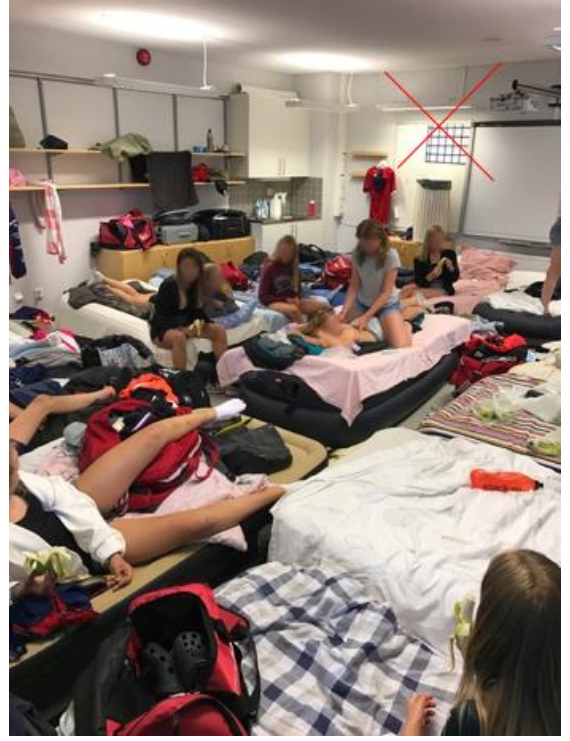
Example of mattresses that are too wide

dormitory. If this happens, we may ask you to sleep in pairs on such a mattress. This is due to requirements from the fire department.